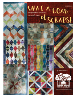
WHAT A LOAD OF SCRAPS!