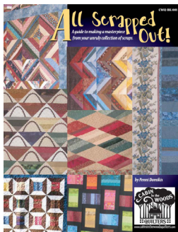
ALL SCRAPPED OUT!