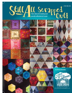
STILL ALL SCRAPPED OUT!